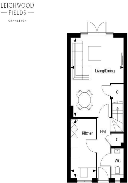
Leighwood Fields, The Maples - The Hare, Property 270, Ground Floor